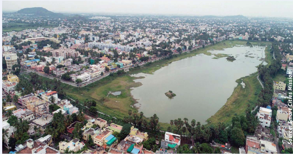
Restoration of water bodies in Chennai Smart City

NIUA has commissioned a study to document good practices and innovative approaches in localising Sustainable Development Goals (SDGs) in collaboration with GIZ. The study intends to support states across India to provide guidance for developing strategies for implementing and localising SDGs. Three consultative workshops were conducted with the states of Tamil Nadu, Kerala, and Assam between July and September to identify key challenges on SDGs implementation. The final knowledge product— Compendium of Good Practices and Innovative Approaches in Localising Sustainable Development Goals —will help cities to localise and implement the SDGs. Prof. Debolina Kundu is leading the study from NIUA. For more details on the study, click here .